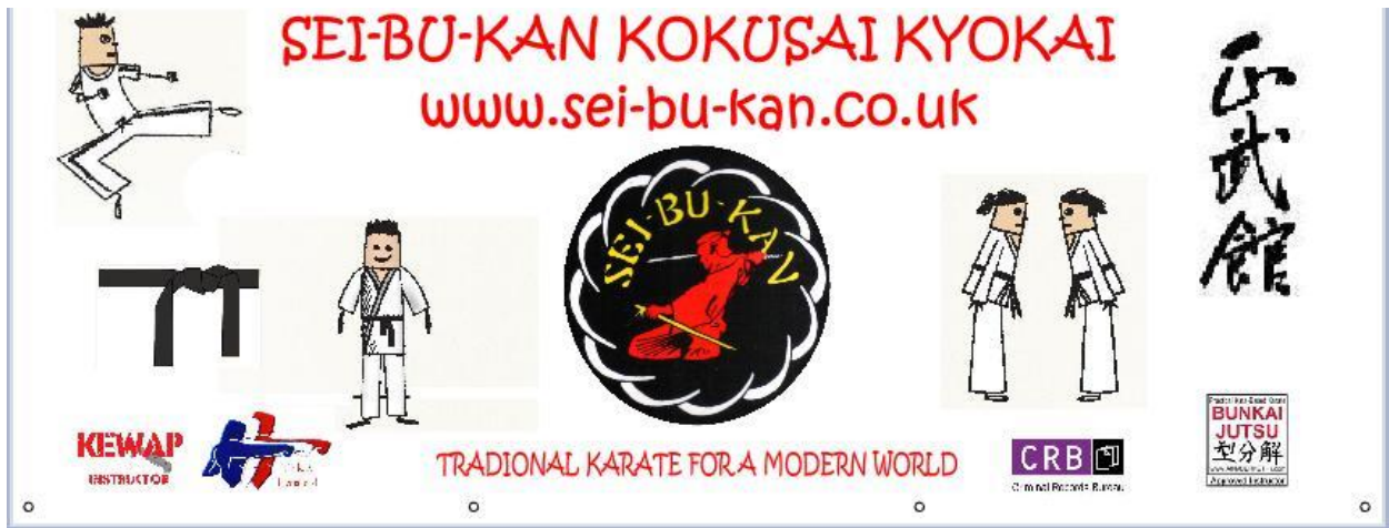
New Southampton Banner