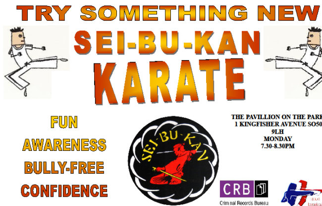
New Eastleigh Flyers