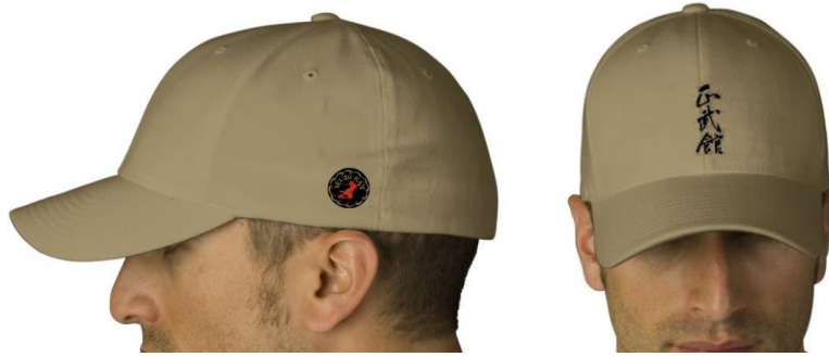
New Sei-Bu-Kan caps draft (cap colours not final)